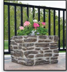
Flower Box Planter (Stack Section)