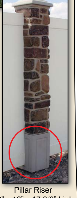
12" x 12" x 17 3/8" high (Same color as cap)