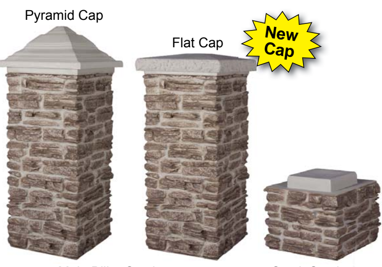
Main Pillar Section 21" x 21" x 46" high (Add 10 1/2" for pyramid cap and 4" for flat cap)